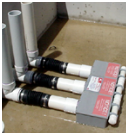
Installation overview of a MULTIPLE outlet FLOUT*

2. Prime and glue vent outlet and wall fitting with PVC cement. The vent should be plumb to the floor. Observe flow direction. The chamfered end of the vent is where the flex connector is attached.