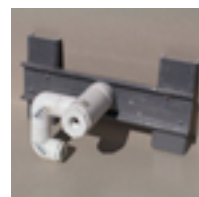
(1) Support Assembly