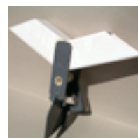
(1) Transfer Bucket