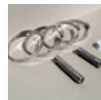
(1) Long Nipple (1) Short Nipple (1) Threaded Cap (4) Clamps