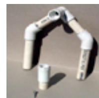
(1) Driftbar (1) Driftbar mount (1) Set Screw