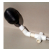
(1) Control Arm